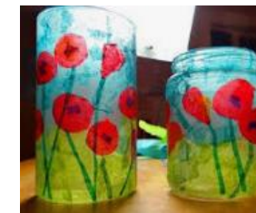
Stained glass lanterns